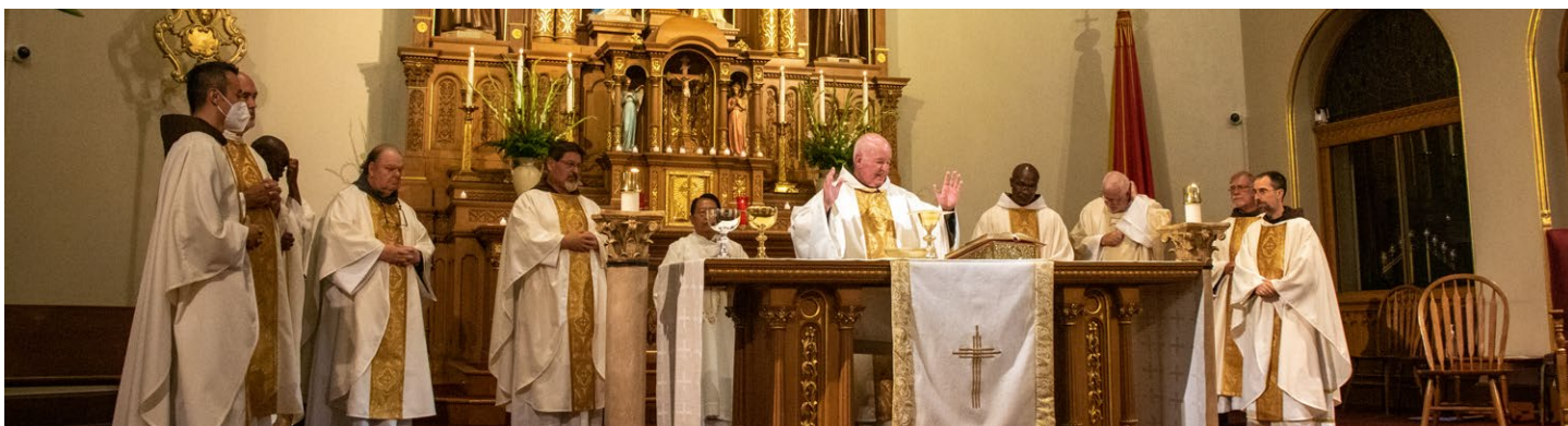
Friars concelebrate the opening mass of the Quinquennial Congress, with attendees filling the basilica.