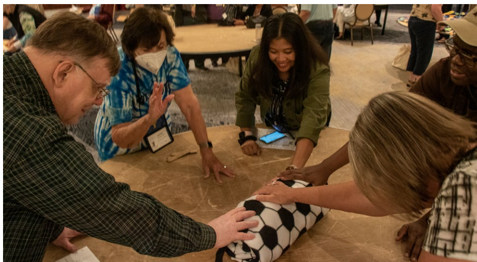
"Q" attendees prep and pray over blankets for the homeless.