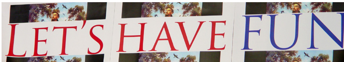
Workshop banner refers to "FUN" acronym for the formators' manual.