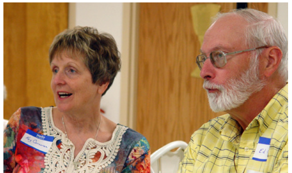
Participants became engaged in the discussions (above and opposite page).