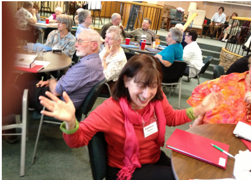
Participants enjoyed engaging in small-group discussions (this page and opposite).