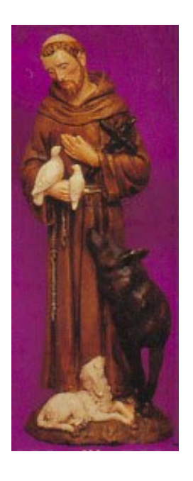
Blessed Kateri Tekakwitha Region The Secular Franciscan Order

Published by BKTR Region of The Secular Franciscan Order