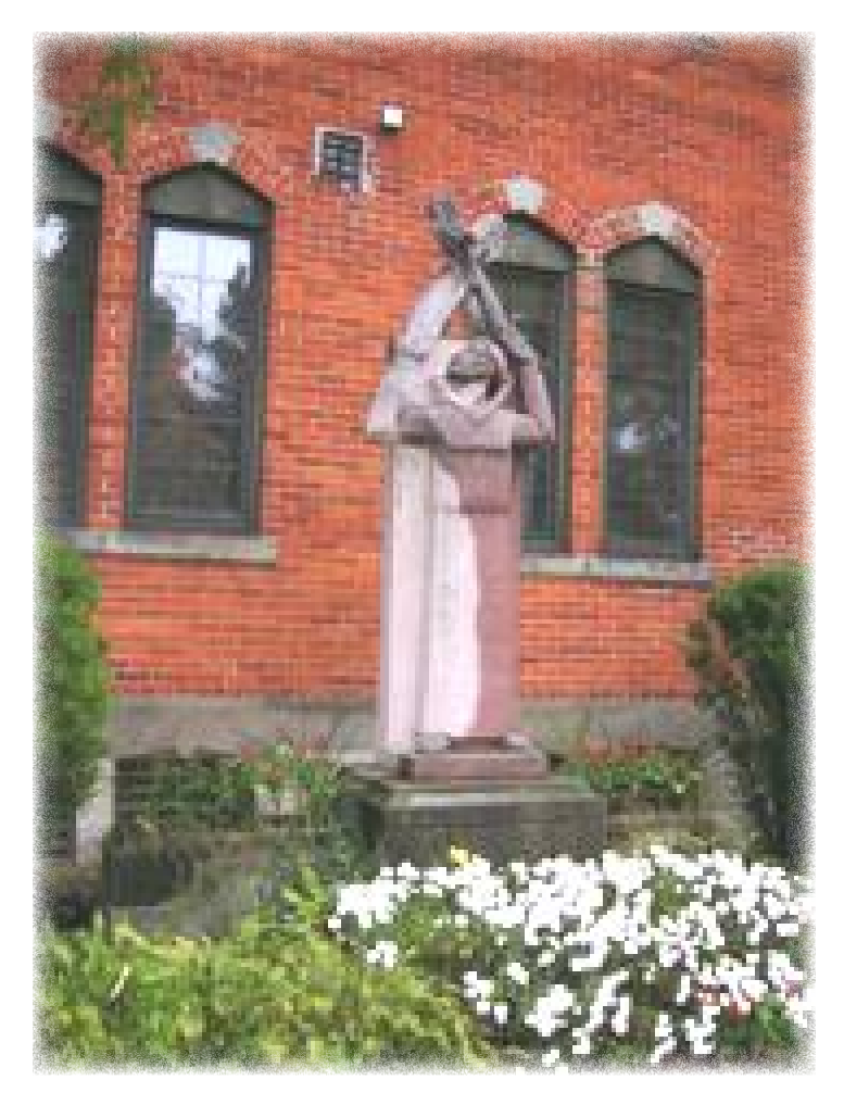
Pax et bonum...