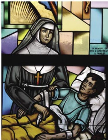
Stained glass window at St. Joseph-St. Patrick Parish Center portrays Mother Marianne caring for leprosy patient. An award named after her will be presented at the 150th anniversary dinner in Utica.

Another highlight will be the presentation of the inaugural Mother Marianne Cope Award, named after the Francis-